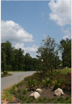
MAGNOLIA FOREST QUINCY, FLORIDA